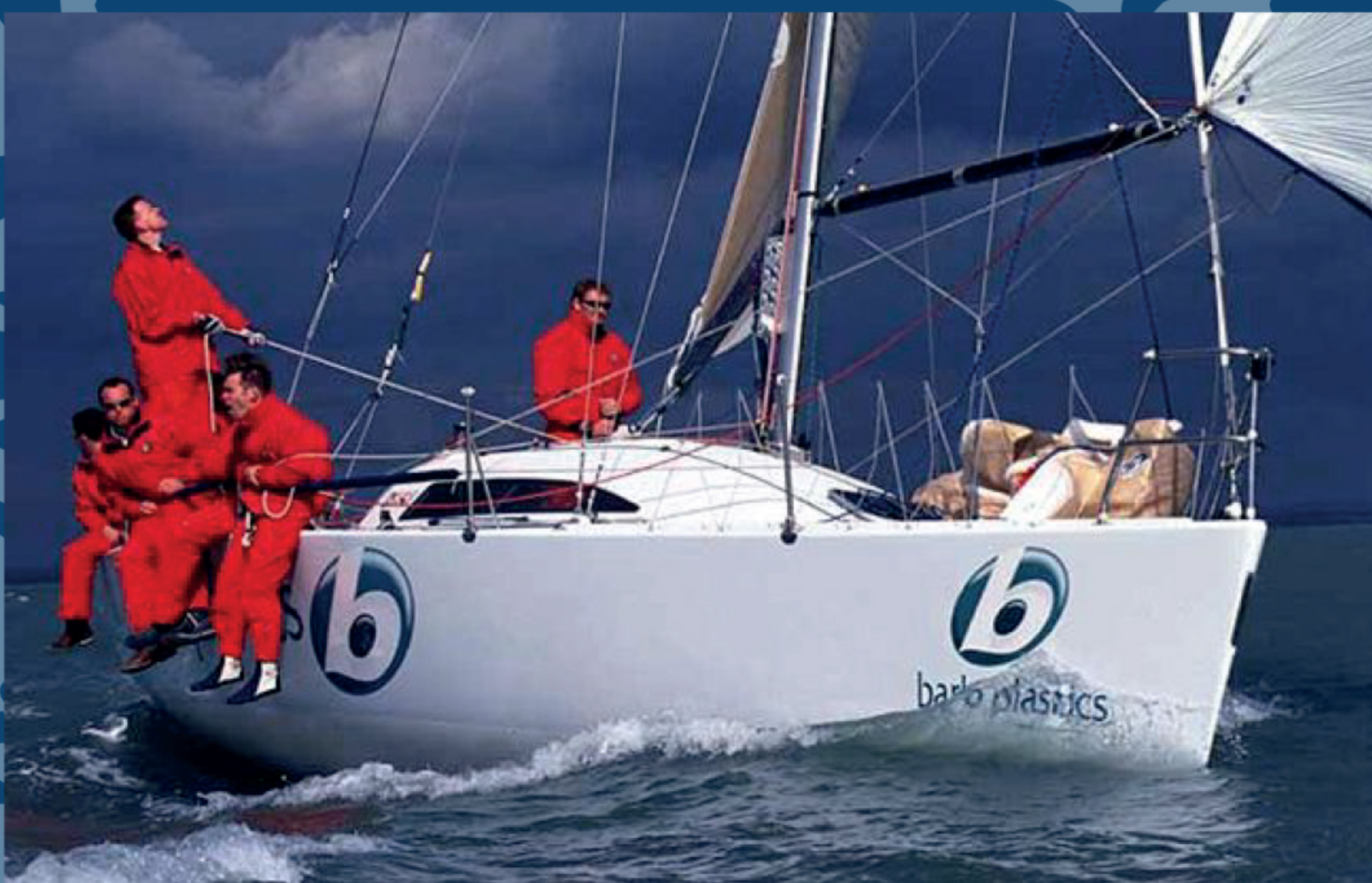
1993:Mumm 36 Barlow Plastics, a new era in yacht design and performance