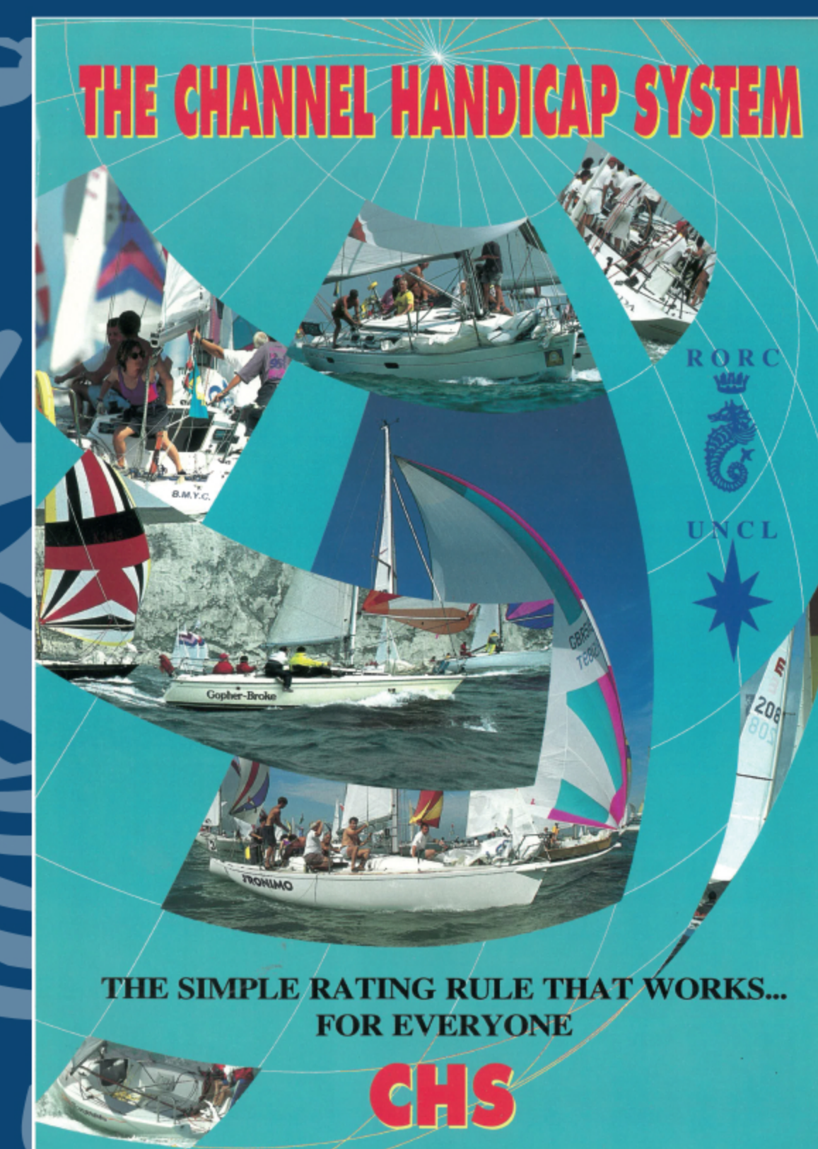
1993: Channel Handicap System (CHS)