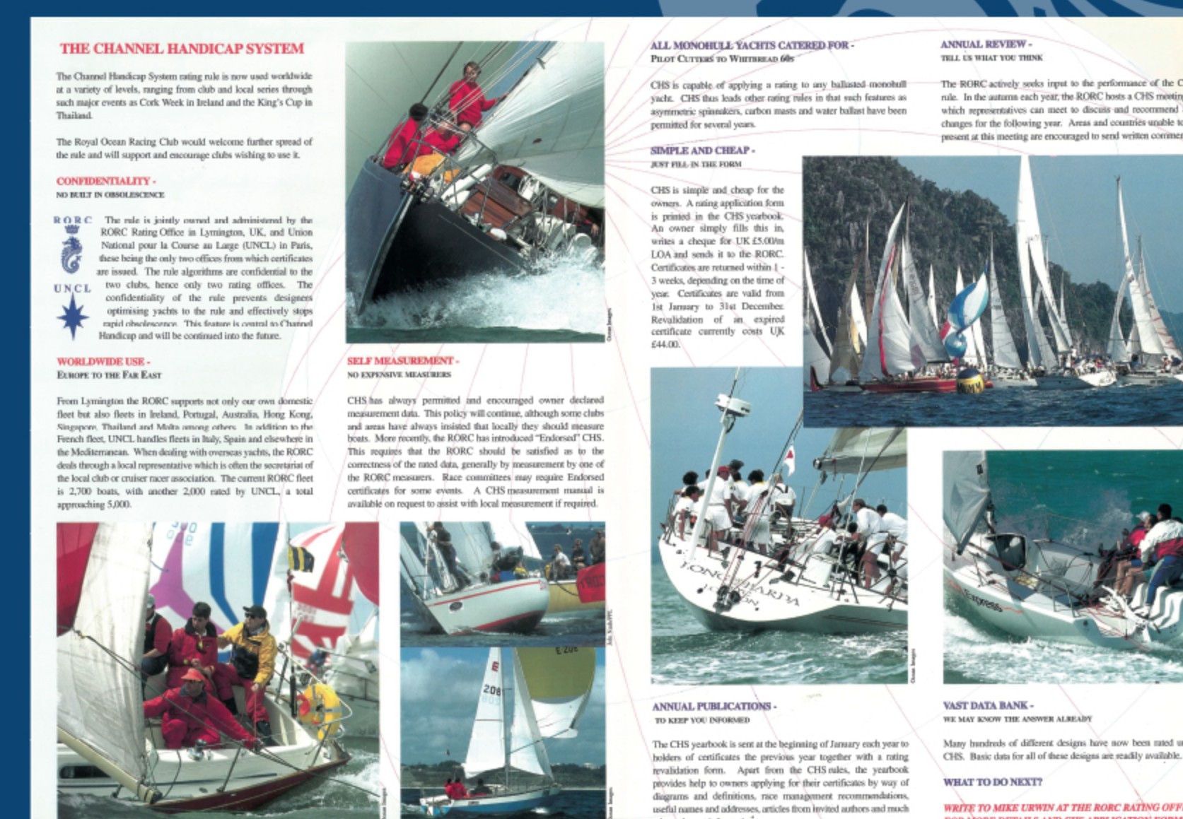
CHS Rule Leaflet: Published to standardise yacht measurement and promote fair racing